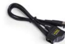
PA04 mini XLR to D-tap Cable for EVF4RVW/PG32e