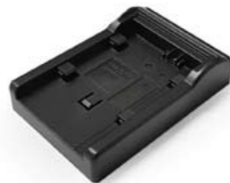
BH-BP808 : Battery Holder for Canon BP808 series