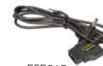
FCB043 DC plug with D-tap cable for L10