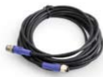
ECF405 5m 4 pin extension cable for FL800