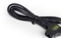
PA05 DC Plug with D-tap Cable for LM400/LM200