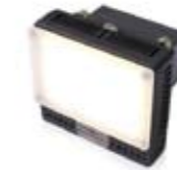
LD-11 : Diffuser for L10