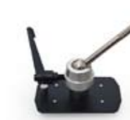
BL-LM1600R Ball head for LM1600 with Rod