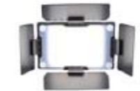
BD02 : Barn door for LM200