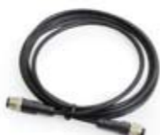
ECF603 3m 6 pin extension cable for LM1600