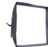
SB-LM400 : CL800 LED Panel only