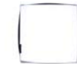
LD-FL400 : Soft diffuser Set for FL400