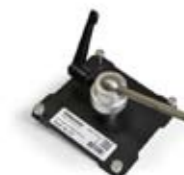
BL-FLR Ball head for Panel support with Rod