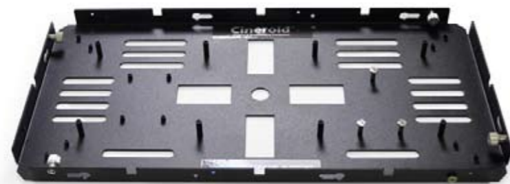
PS800 : Support panel for Flexible LED light