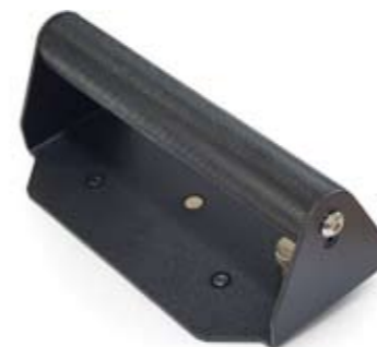
HG-LM1600 : Hand grip for LM1600