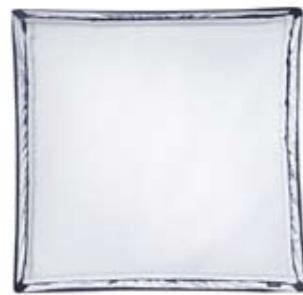
SB-FL2x2 : Softbox for support panel 2 unit