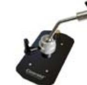
BL-LM1600S Ball head for LM1600 with 16mm spigot