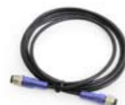
ECF403 3m 4 pin extension cable for FL800