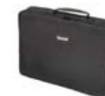
QBG012 Carrying bag for FL800 single set