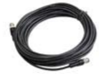
ECF605 5m 6 pin extension cable for LM1600