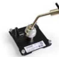
BL-FLS Ball head for Panel support with 16mm spigot