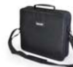
QBG011 Carrying bag for FL400 single set