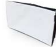
LD-FL800 : Soft diffuser Set for FL800 (ML800 / CL800)