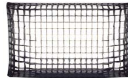
GD-FL4x2 : Grid for SB-FL4x2