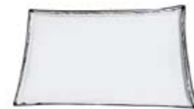
SB-FL4x2 : Softbox for support panel 4 unit