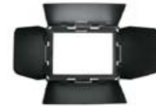
BD04 : Barn door for LM400