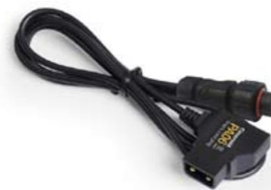
PA06 : 2 pin with D-tap for FL400 / ML800