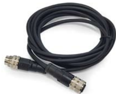
ECF1603 : 3m 6 pin extension cable for CFL1600