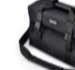
QBG015 Carrying bag for FL800 3 set