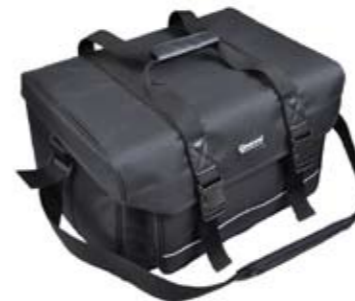
QBG009 : Carrying bag for LM400 3 units