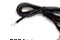
FCB044 DC plug only cable