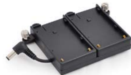
YCS079 : LM200 mount for NPF L series